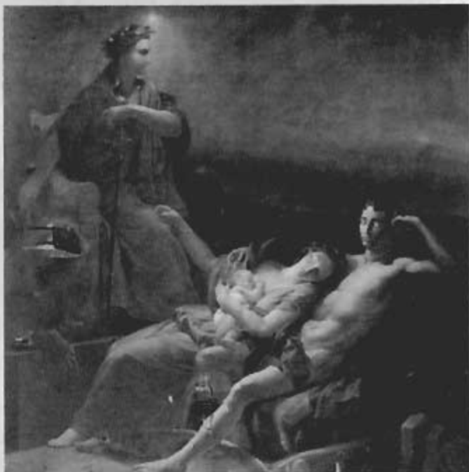
"Justice Guarding the Sleeping World" by David Hunter Strother.

The Collection is delighted to have the paintings, as they shed considerable light upon the foundations of Strother's multifaceted career.