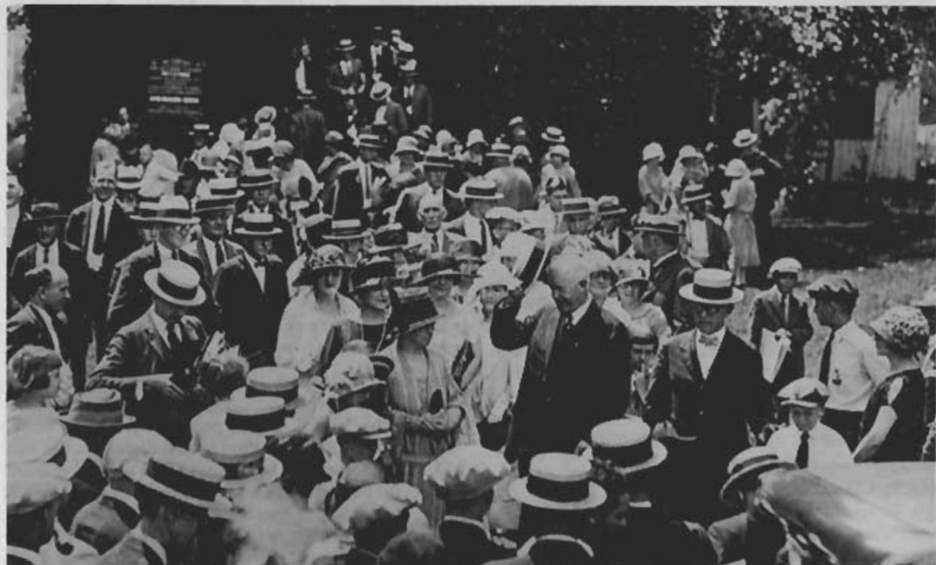
John W. Davis tips his hat to a Clarksburg crowd, August 1924.