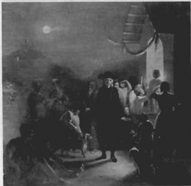
"The Lighting of the Shrine" by David Hunter Strother.

Strother's journals reveal that both of the newly acquired paintings stem from this period. The first, entitled "The Lighting of the Shrine," is enumerated among a group of works listed under the heading, Florence 27 March 1842. Measuring 36" x 31½", the painting depicts the nocturnal lighting of a shrine to the Madonna.