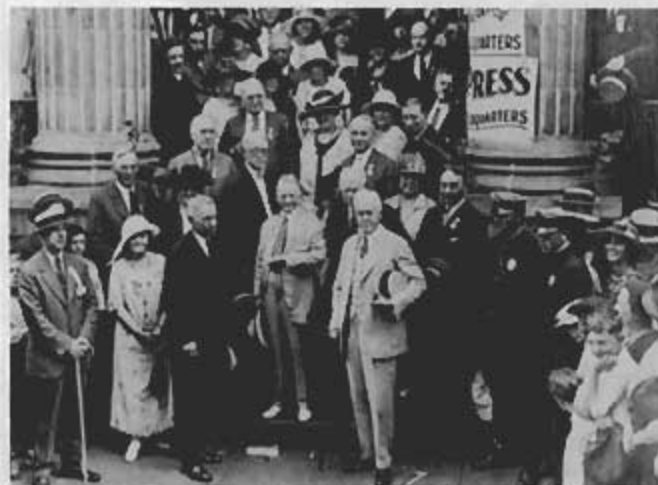
John W. Davis, presidential nominee, poses with crowd in front of the Clarksburg Elks Hall, Aug. 11, 1924.